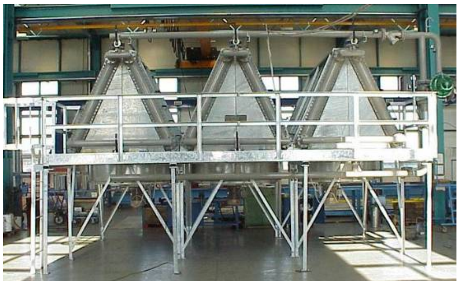
Figure by Fortum

SÄTEILYTURVAKESKUS • STRÅLSÄKERHETSCENTRALEN RADIATION AND NUCLEAR SAFETY AUTHORITY